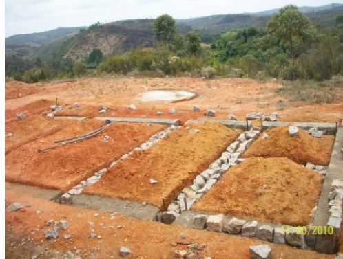
The beginning of the construction by September 2010.

legal paperwork, assign medical doctors, and begin construction.