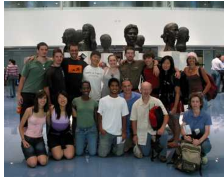
Members of the HPSD trip to El Limón gather in the airport in Managua on the last day of the trip

Between May 28 and June 9, 2007, 16 of our members traveled to Nicaragua on our first trip as an organization. During that time they lived in home-stays in the community of El Limón. All members learned a great deal during the trip and at the same time each, giving up two weeks of their vacation plus countless hours of preparation, did a great deal of good.