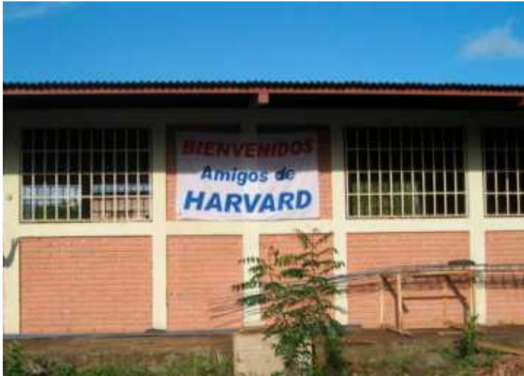
Community members decorated the community center to welcome the group

During the trip students lived in groups of two or three in home stays where they spent as much time as possible with their host families. The goal was to build relationships grounded in equality. Students worked side-by-side with their host families and exchanged stories, jokes, and tears.