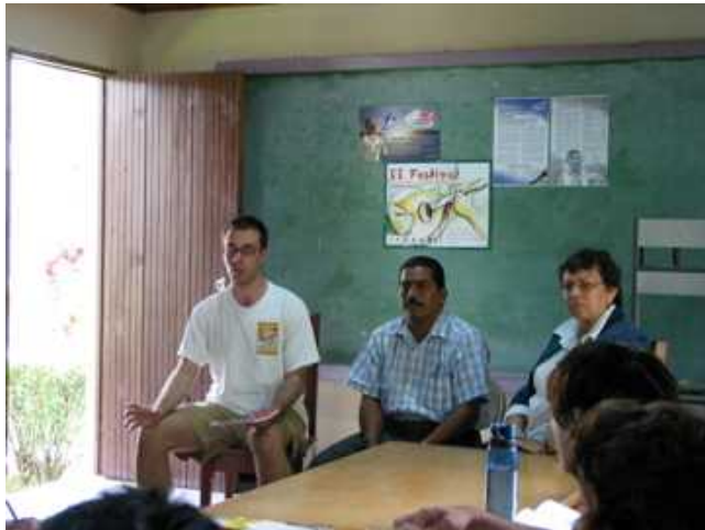
The HPSD met with the Mayor and Vice Mayor of Estelí to discuss issues relating to our work in Nicaragua

A major aspect of the trip was learning. We believe that in order to build relationships based on equality we need to create exchanges with community members founded in mutuality and partnership. During the trip there were a number of organized events which were scheduled to help us learn as much as possible about the culture, the community, and the people of El Limón. We met with the Mayor and Vice Mayor of Estelí to talk about some of the general needs of the region and learn in what way they felt we could best operate in our work. We met with community leaders of another community called Chacraseca in a forum to learn about projects that have been done in their community and ways that we could work to achieve similar successes and try to avoid some of the mistakes. Additionally we met with Witness for Peace, an agency in Nicaragua that focuses on how US policy affects Nicaragua. We learned a great deal from these meetings and are trying to implement this into our vision, mission, and mode of work.