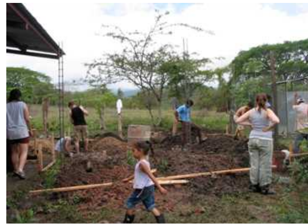
HPSD members work side by side community members on the construction of the community kitchen

HPSD sponsored and worked with community members on the construction of a new kitchen. HPSD and community members partnered every bit of the way during the trip, purchasing the materials together and doing the actual construction. It was a positive experience for all and was another means for fostering interaction between trip members and community members.