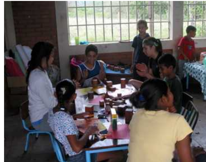
HPSD members work with young students at the pre-school in El Limón. The arts and crafts day with the students was an important aspect of the trip for many of the members and allowed for great interaction between the children and the HPSD membership

HPSD members also volunteered at three schools during the trip where they taught lessons to the students. They worked alongside teachers with students from pre-school and primary school. The conditions in the schools were difficult and none of the schools had sufficient materials. The pre-school in El Limón was without a chalkboard and bookcase. Trip members decided to pay for the construction of a chalkboard and a bookcase for the El Limón pre-school and materials (paper, pens, pencils, notebooks, etc) that had been brought down were left in all three schools.