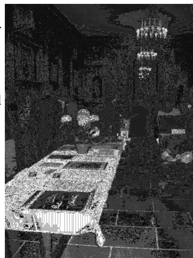
Banquet guests gather near tables decked with 50 years of BachSoc memorabilia.