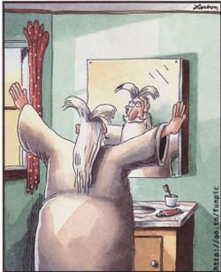
Moses parting his hair